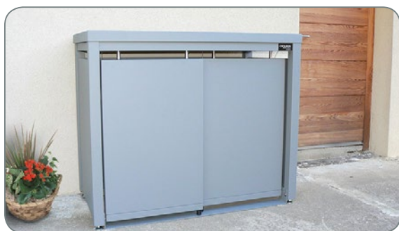
Model BLANK (without cut-outs) For 2 x 120L containers. Colour: RAL 7040