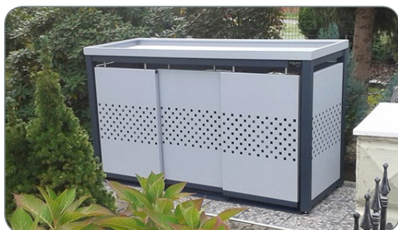
Model QUBIS (cut out squares) For 3 x 120L containers. Colour: RAL 7016, RAL 9006