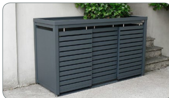
Model LINIS – for 3 x 120L containers Colour: RAL 7016