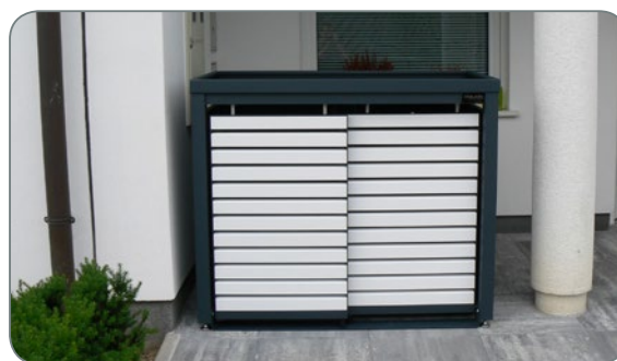
Model LINIS – for 2 x 120L containers The aluminium slats in colour RAL 9003