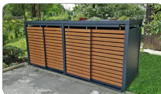
Model LINIS – for 4 x 240L containers The aluminium slats in the wood imitation DEKOR 4